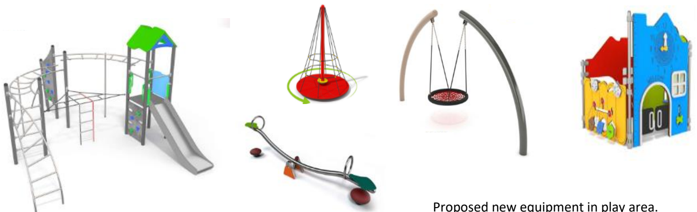
Proposed new equipment in play area.

This is a significant investment for the Parish and has been hugely supported by S106 funding paid by developers towards the cost of providing community and social infrastructure needs which has arisen as a result of the development taking place on the Bluebird site in Hunnington where no provision of play area resources was provided.